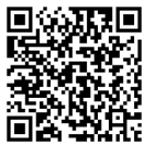
S410 3D demo